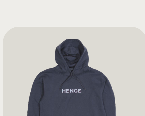
Essentials Hoodie $75.00