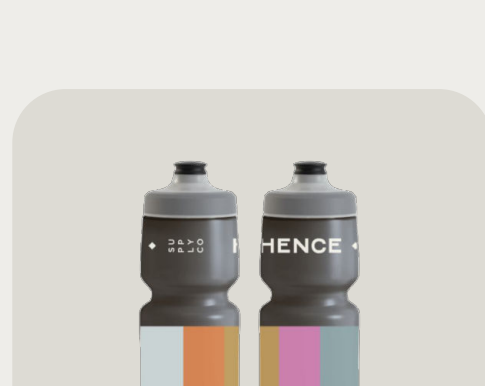
Is This Thing On Bottle $16.00